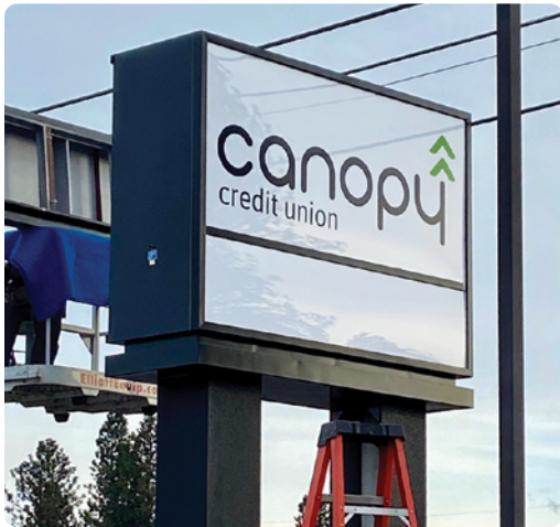
new signage going up at 1212 W. Francis

As you may have heard, as of January 1, 2020, Canopy Credit Union is now the exclusive owner of the existing North Branch located at 1212 W. Francis.